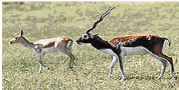
The blackbuck above and the chinkara below are protected by the Wildlife Protection Society of India (WPSI)

The prosecution has listed 19 witnesses in the charge-sheet, in support of its case. The arms seized from Salman Khan were released by the court early this year.