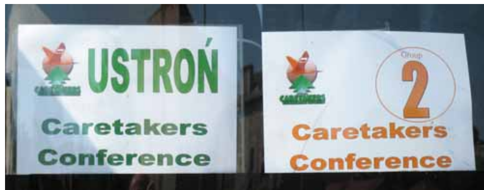
Windshield of Bus #2

In the short space of the next two pages, you can see some of the highlights to get some impressions of the great conference the host country, Poland, provided. An excellent Post Conference Book can be viewed at www.cei2006.org for more details.