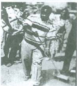
market owners and homeowners willingly joined in the clean up efforts.

Caretakers of the Environment-Kenya (CATEK) in Oyugis town started this clean up activity in 1999. They began by conducting clean up awareness workshops in the area around the town. Local people embraced the idea and word spread. Soon students, school staff,