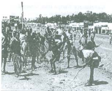
Entire communities take part in cleaning

The idea of classifying rubbish into organic and toxic classes was a new idea introduced to the area. The concept of recycling was also new and resulted in planning for a facility to be used by all community members. Some of the waste collected has been found to be a suitable substitute for lighting charcoal stoves (Jikos). CATEK has made long term plans to continue assisting with and supporting the effort to keeping a cleaner environment.