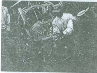
Catek Tree Nursery