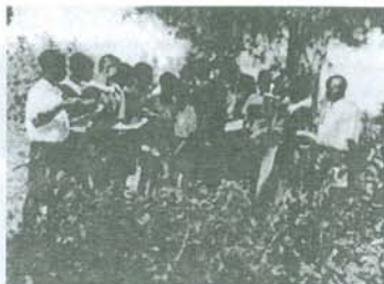
Pictures above show students carrying out mapping and identification of flora using two detailed transects in each 3x10 meter area.