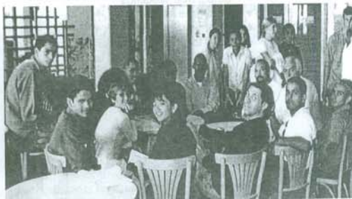
First meeting of RIACA organizers in Turin