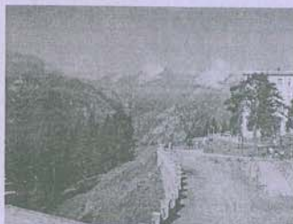
Pracatinat in the Italian Piedmont...venue of the 16 th annual conference.