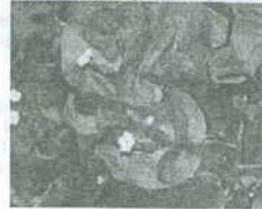
Plane-tree, Agave, Magnolia, and Yucca