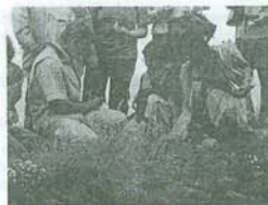
Invasive or not?